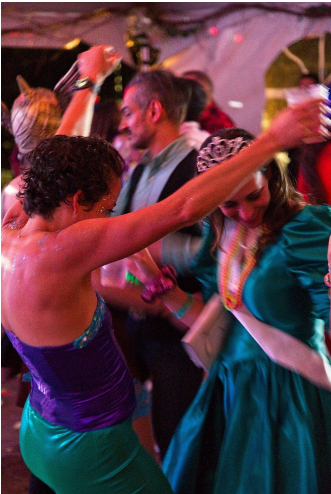
Novel Night After-Party

We thank the Friends in particular for the unbelievable creativity used in designing safety protocols for Novel Night, which included outdoor dinners and a pre-event drive-through Covid-19 testing site in the Library's parking lot. The next Novel Night will be in Fall 2023!